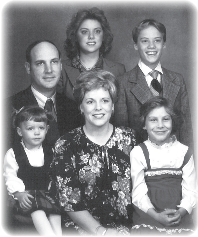
This Marriott family portrait was taken in 1979.